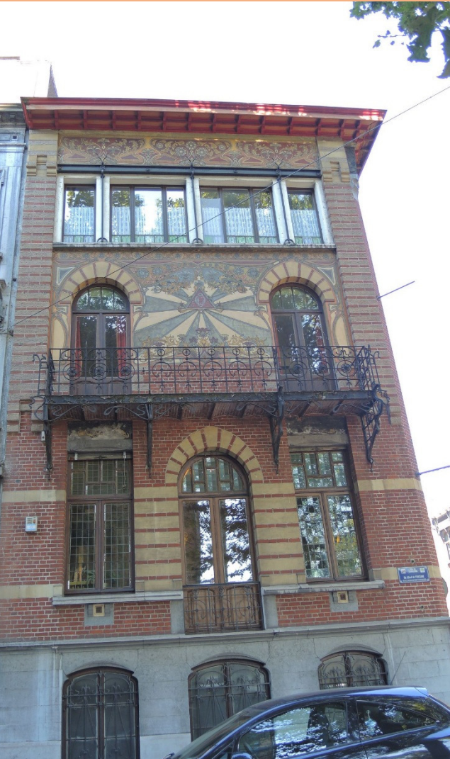
The Gold House